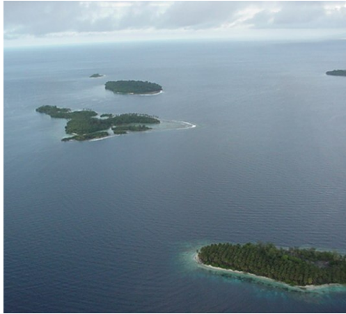
Building peace in the Solomon Islands

The Right Honourable Sir Albert Rocky Palmer has been appointed the new Chief Justice of the Solomon Islands. From 1999 to 2002, an internal ethnic conflict ravaged the country, resulting in the collapse of the economy and the breakdown of law and order. In 2003, the government invited Australia and New Zealand to assist in repairing the damage. The Regional Assistance Mission to Solomon Islands (RAMSI) was established in response. Military and police personnel from these two countries were sent to restore order. When RAMSI arrived, the judiciary was the only institution left intact. However, it was dangerously close to collapsing due to lack of government funding. RAMSI has provided financial and human resources support in an effort to strengthen the judiciary. In the meantime, hundreds are in custody and are awaiting trial as a result of the conflict.