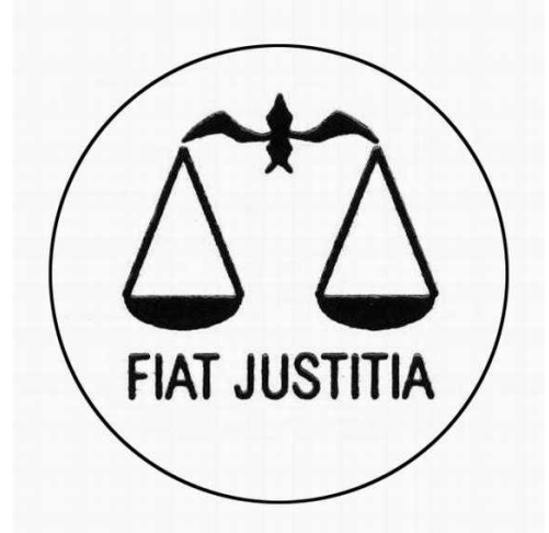
Logo of the Eastern Caribbean Supreme Court