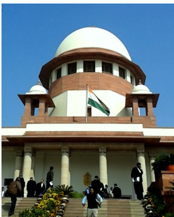
The Supreme Court of India

Delhi Judicial Academy: http://www.judicialacademy.nic.in