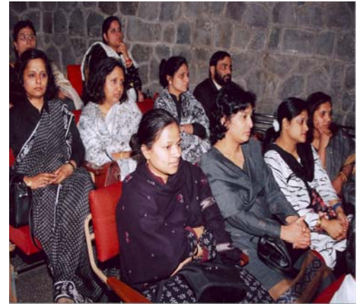
Women participants listen to the presentations in Delhi

A productive and successful formal programme was supplemented by visits to the Mughal Gardens, the Red Fort, and the Supreme Court of India in Delhi. In Agra, participants saw the Taj Mahal, the Agra Fort, and the UNESCO World Heritage Site of Fatehpur Sikri (the City of Victory). To add a physical challenge to the proceedings, yoga instructors led the participants in morning sessions for the duration of the Bhopal programme.