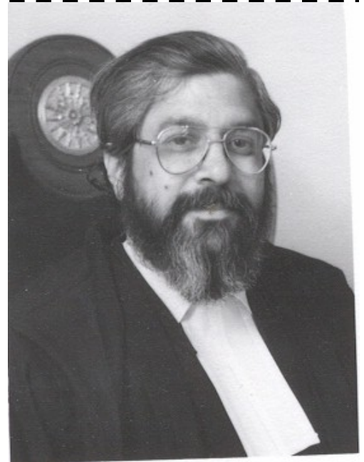
Justice Lokur

For more information on the Delhi High Court, please visit: http://delhihighcourt.nic.in/