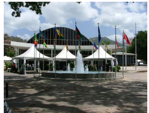
Queen's Hall in Port of Spain, Trinidad & Tobago

The Right Honourable Mr. Justice Michael De La Bastide, President of the Caribbean Court of Justice